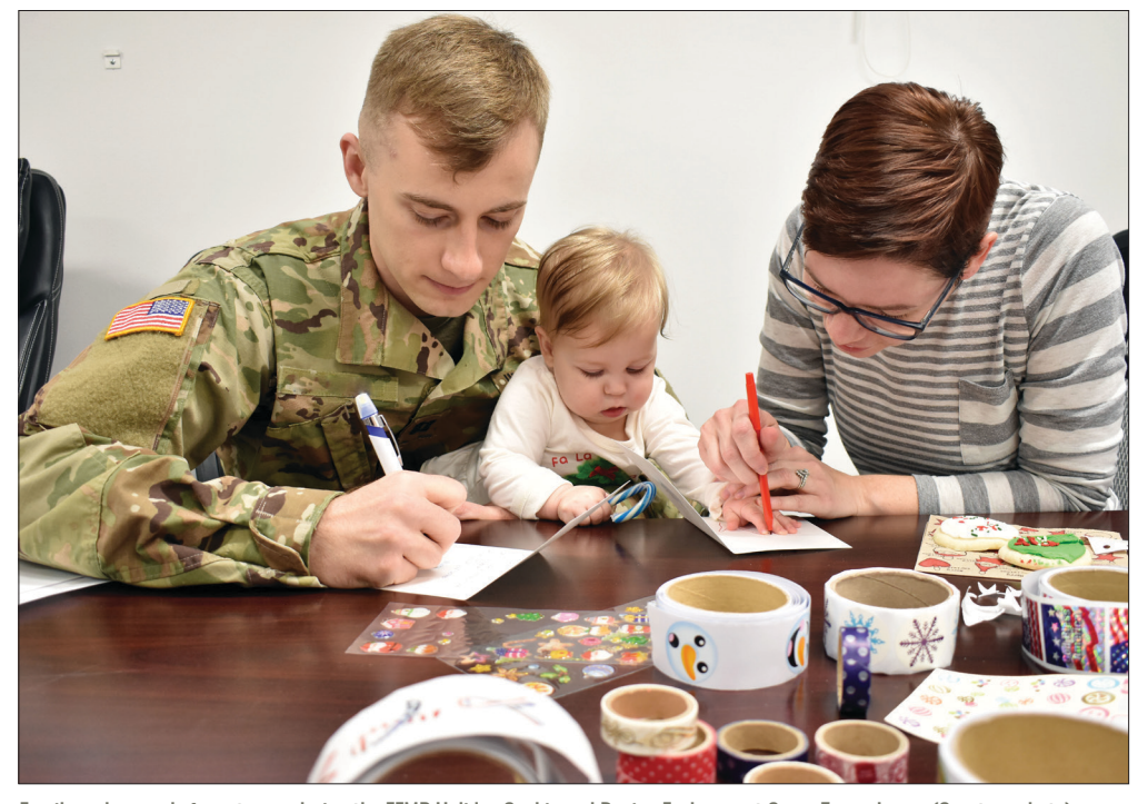
Family makes cards for veterans during the EFMP Holiday Cookie and Recipe Exchange at Camp Zama, Japan.

One of the most sought-out benefits of the program is Family Support. This service consists of systems navigators (staff members located on most Army installations who guide Families' needs through systems of care), respite care (which provides a temporary rest period for Family members responsible for regular care of people with disabilities) and DirectSTEP staff (who teach military children). Another important resource is Education Services, which includes information on where Families can access video libraries, education