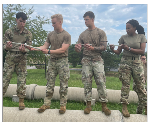
Soldiers partake in wellness obstacle course guided by performance experts.

Murphy conducted a leadership development workshop and a loaded ruck march through the wellness campus to conclude the week.